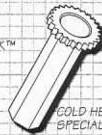
GOLD HEADED SPECIALTY